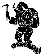
SOCIETY FOR POST-MEDIEVAL ARCHAEOLOGY