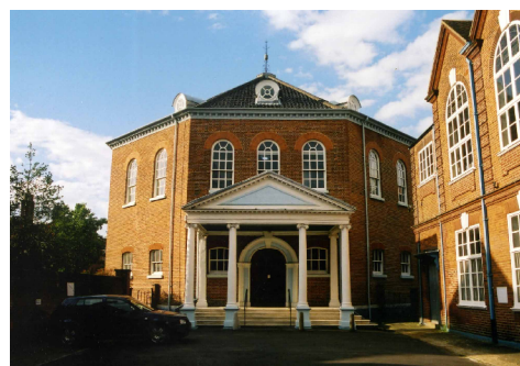
The Octagon Chapel, Colegate, Norwich

The conference venue is located in the heart of Norwich, a city with a long history of religious diversity, and many fine survivals of post-medieval religious architecture. The conference is timed to coincide with the Heritage Open Day weekend (11 th -14 th September) , providing an unparalleled opportunity to explore many aspects of this unique heritage, including many churches, chapels and other religious buildings not usually open to the general public.